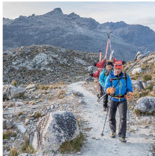
Trekking and Expeditions

The Environmental and Access Committee works to strengthen both sustainable travel and work and the rights of the professional mountain guides to work and access all alpine terrain.